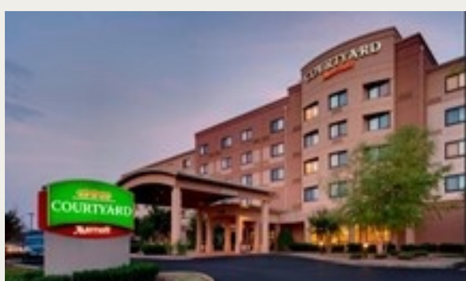
Courtyard by Marriott Bristol 3169 Linden Drive Bristol, VA 24202 (276) 591-4400