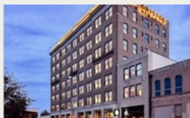
The Bristol Hotel 510 Birthplace of Country Music Way Bristol, VA 24201 (276) 696-3535