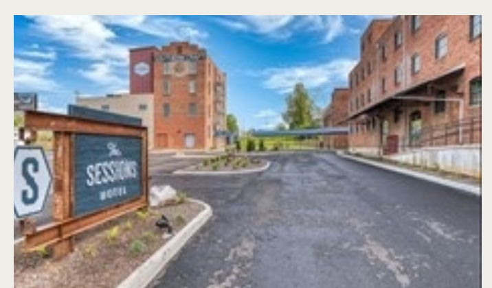
The Sessions Hotel 833 State Street Bristol, VA 24201 (276) 285-5040