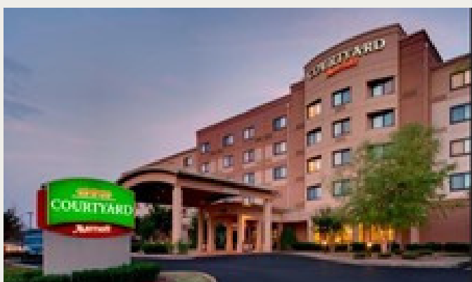
Courtyard by Marriott Bristol 3169 Linden Drive Bristol, VA 24202 (276) 591-4400