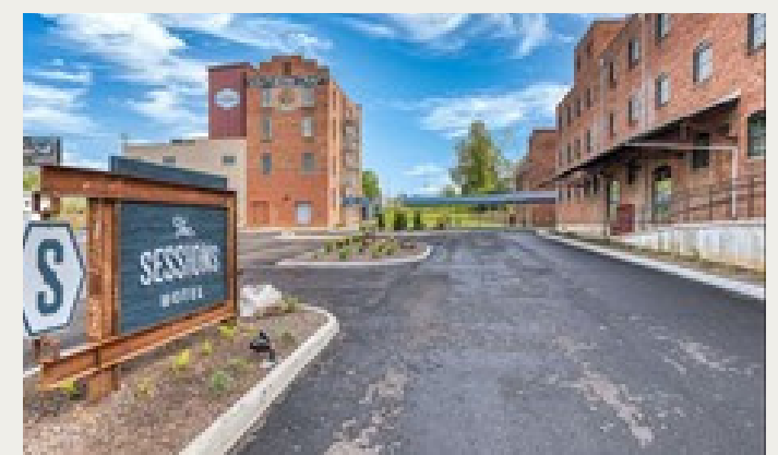
The Sessions Hotel 833 State Street Bristol, VA 24201 (276) 285-5040