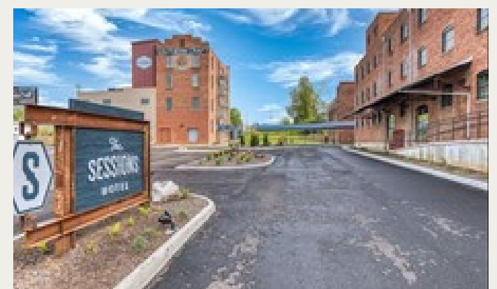
The Sessions Hotel 833 State Street Bristol, VA 24201 (276) 285-5040