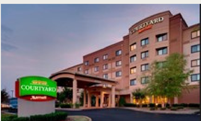
Courtyard by Marriott Bristol 3169 Linden Drive Bristol, VA 24202 (276) 591-4400