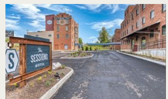
The Sessions Hotel 833 State Street Bristol, VA 24201 (276) 285-5040