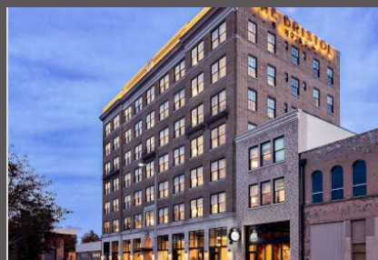
The Bristol Hotel

3169 Linden Drive Bristol, VA 24202 (276) 591-4400