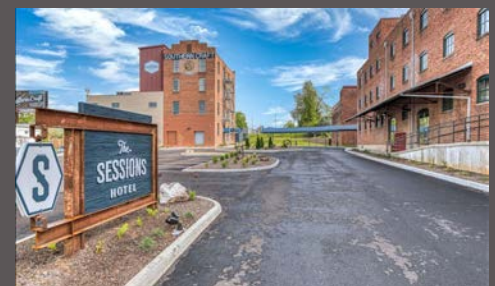
The Sessions Hotel

510 Birthplace of Country Music Way Bristol, VA 24201 (276) 696-3535