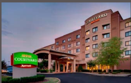
Courtyard by Marriott Bristol

Several hotels are located within a few miles of our campus.